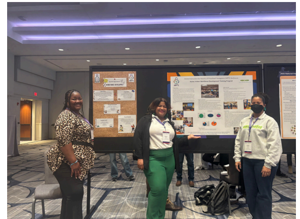
HIPPY at NHVS

It was a wonderful opportunity to learn from one another and build relationships.