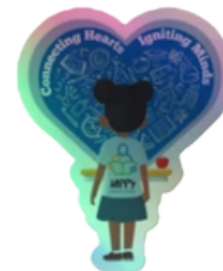
laser cut stickers